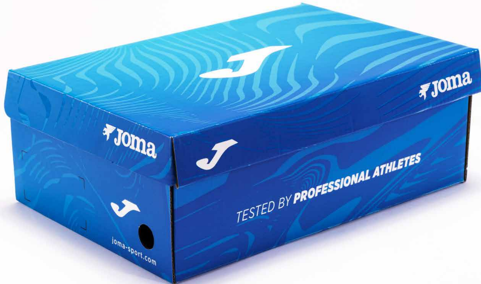
GENERIC FOOTBALL SHOES BOX